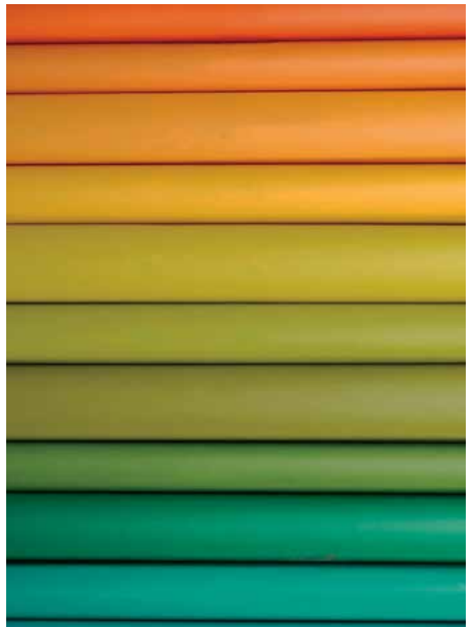
This is how the same RGB image converted to CMYK may appear when printed