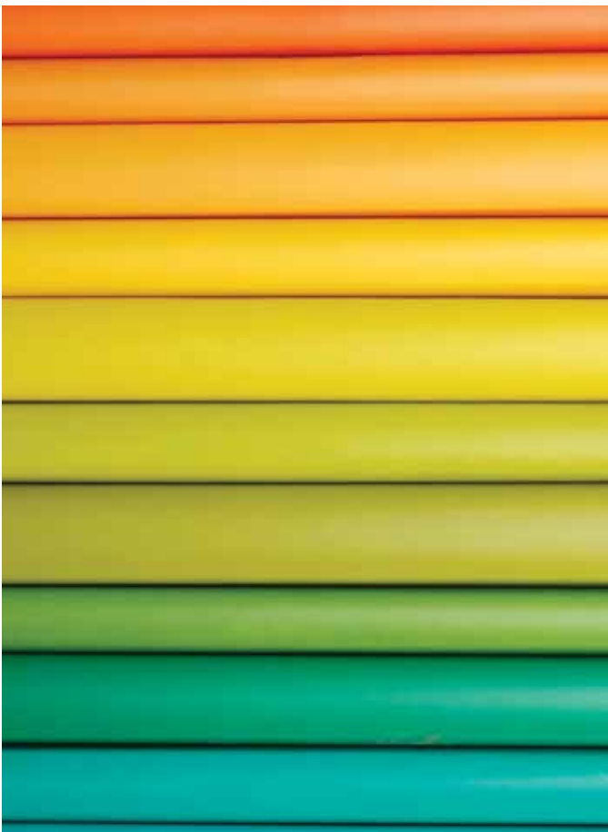
This is how an RGB image may view on your screen

Please do not supply images with 'spot colours' or 'Pantone®' colours without informing us that you would like to use them, as these will again be converted to CMYK.